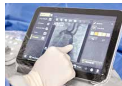
Touch screen module Pro

The standard Windows 10 platform can help support compliance with the latest security and standards to protect patient data. It can also accommodate new software options to extend your system's clinical relevance over time.