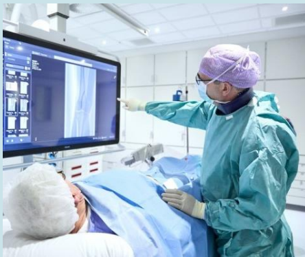
Premium Azurion 7 – DS

Offering OEM refurbished cardiovascular solutions at lower cost that include same as new service, warranty and support. Together we make the difference in minimally invasive treatment to improve patient outcomes and save lives.