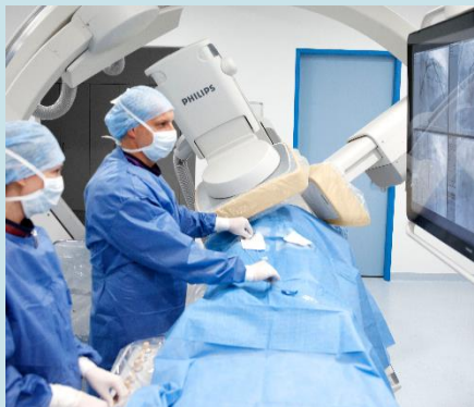
Performance Allura R8.2 – DS